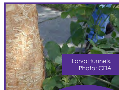
Larval tunnels.