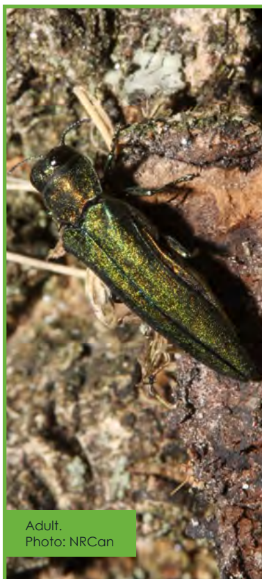
Adult. Photo: NRCan

from the Canadian Forest Service - Laurentian Forestry Centre