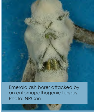
Emerald ash borer attacked by an entomopathogenic fungus.

from the Canadian Forest Service - Laurentian Forestry Centre