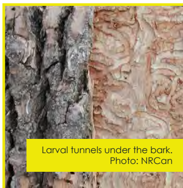
Larval tunnels under the bark.