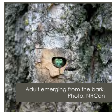
Adult emerging from the bark.