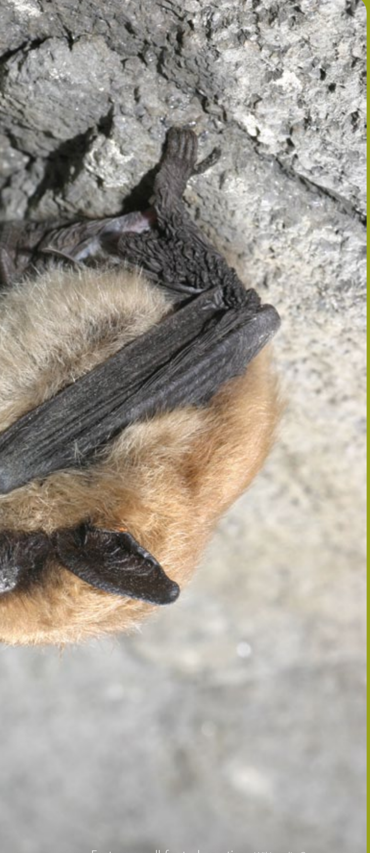
Eastern small-footed myotis

The big brown myotis ( Eptesicus fuscus ) also feeds predominantly on beetles and moths, although its diet may vary depending on environmental conditions (Moosman 2012). A 2012 study revealed that the species' diet consists of 81% beetles, 1% flies, 4% moths and 14% other insects (Moosman 2012). When beetles are scarce, the species turns to caddisflies (small, moth-like aquatic insects) and true bugs (Agosta 2002).